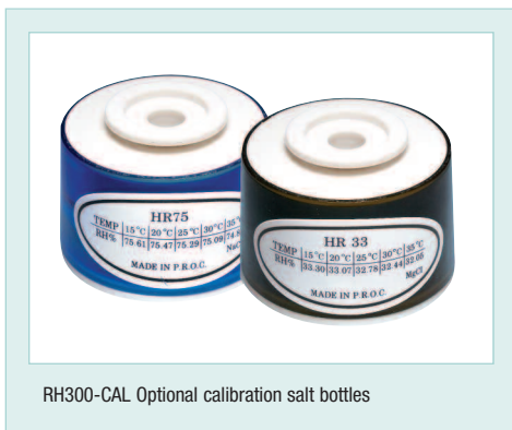
RH300-CAL Optional calibration salt bottles